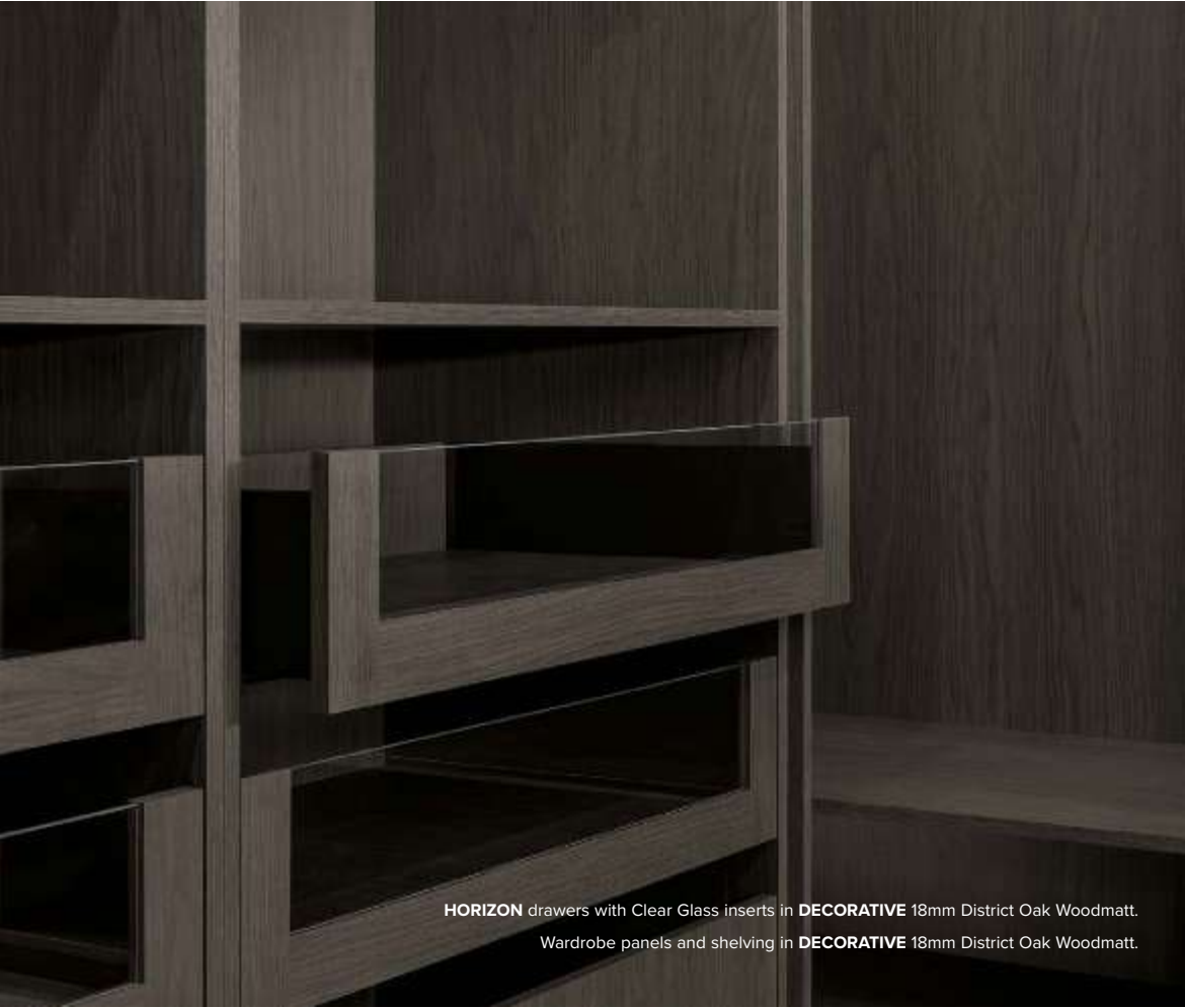
HORIZON drawers with Clear Glass inserts in DECORATIVE 18mm District Oak Woodmatt. Wardrobe panels and shelving in DECORATIVE 18mm District Oak Woodmatt.

polytec swatches and samples represent a small area of the overall colour structure. To view the large colour sample, visit www.polytec.com.au . Dark coloured surfaces will show fingerprints and require more care and maintenance than lighter coloured surfaces. It is recommended to test a product sample prior to colour selection.