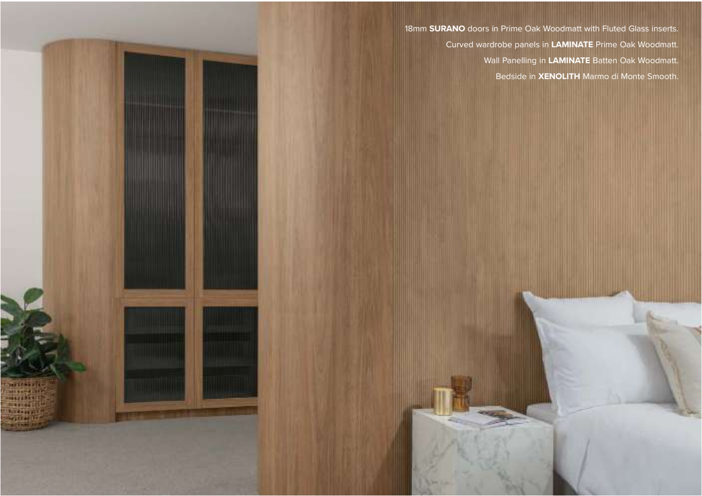
18mm SURANO doors in Prime Oak Woodmatt with Fluted Glass inserts. Curved wardrobe panels in LAMINATE Prime Oak Woodmatt. Wall Panelling in LAMINATE Batten Oak Woodmatt. Bedside in XENOLITH Marmo di Monte Smooth.