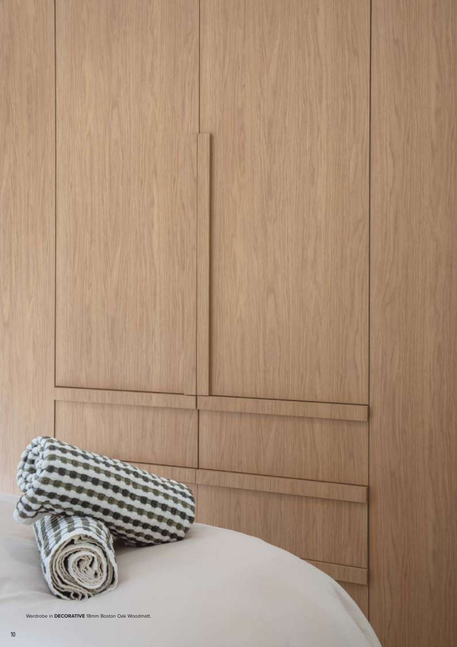
Wardrobe in DECORATIVE 18mm Boston Oak Woodmatt.