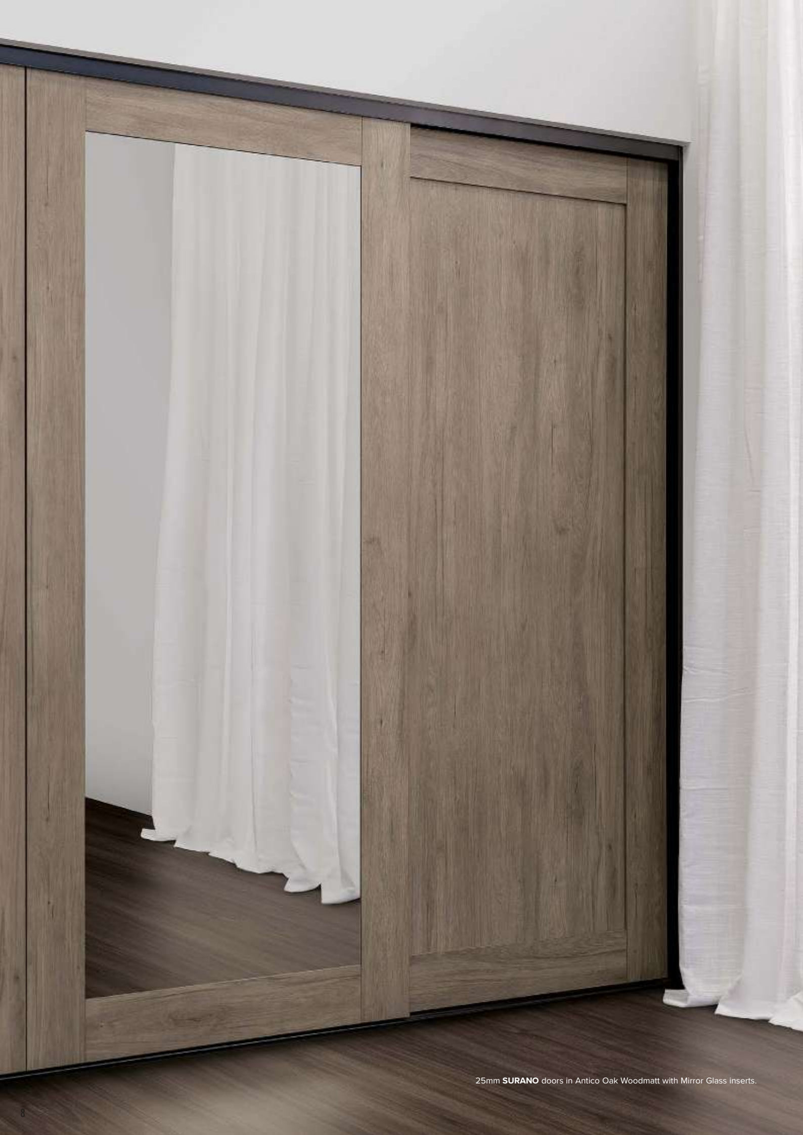
25mm SURANO doors in Antico Oak Woodmatt with Mirror Glass inserts.