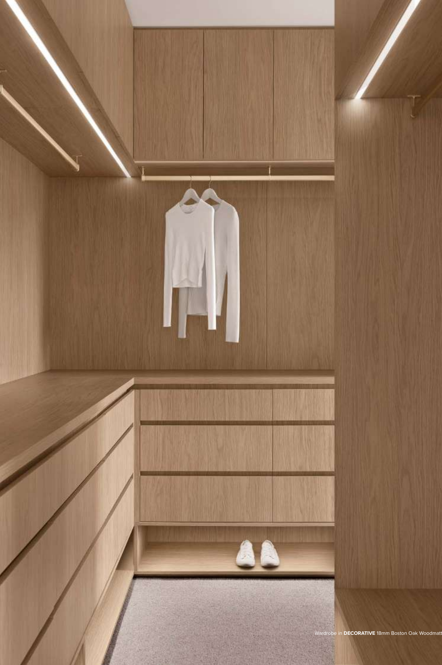
Wardrobe in DECORATIVE 18mm Boston Oak Woodmatt.